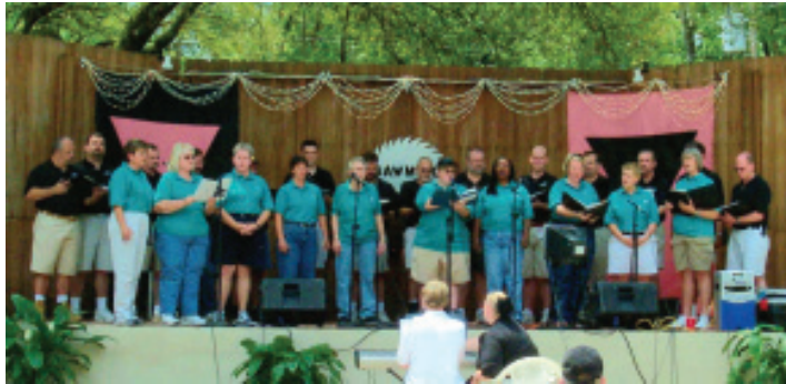
Tampa Bay Women's Chorus